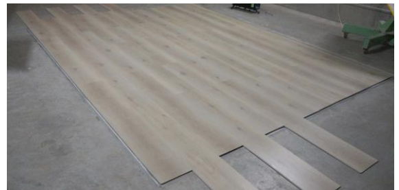
Test specimen installed in laboratory for test.